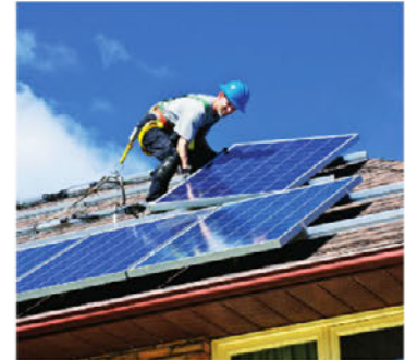
▲ Even as far north as sub-Arctic Alaska, solar panels are viable energy generators.