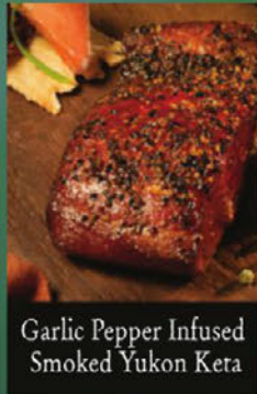
Garlic Pepper Infused Smoked Yukon Keta