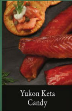
Yukon Keta Candy

Kwik'pak Fisheries is proud to present a sustainable, traceable product that is unique to Alaska's Yukon River. Yukon Keta salmon has the highest oil content and Omega-3s of any Keta Salmon, whether fresh, frozen or smoked. Product is shipped frozen by FedEx. Order online at: