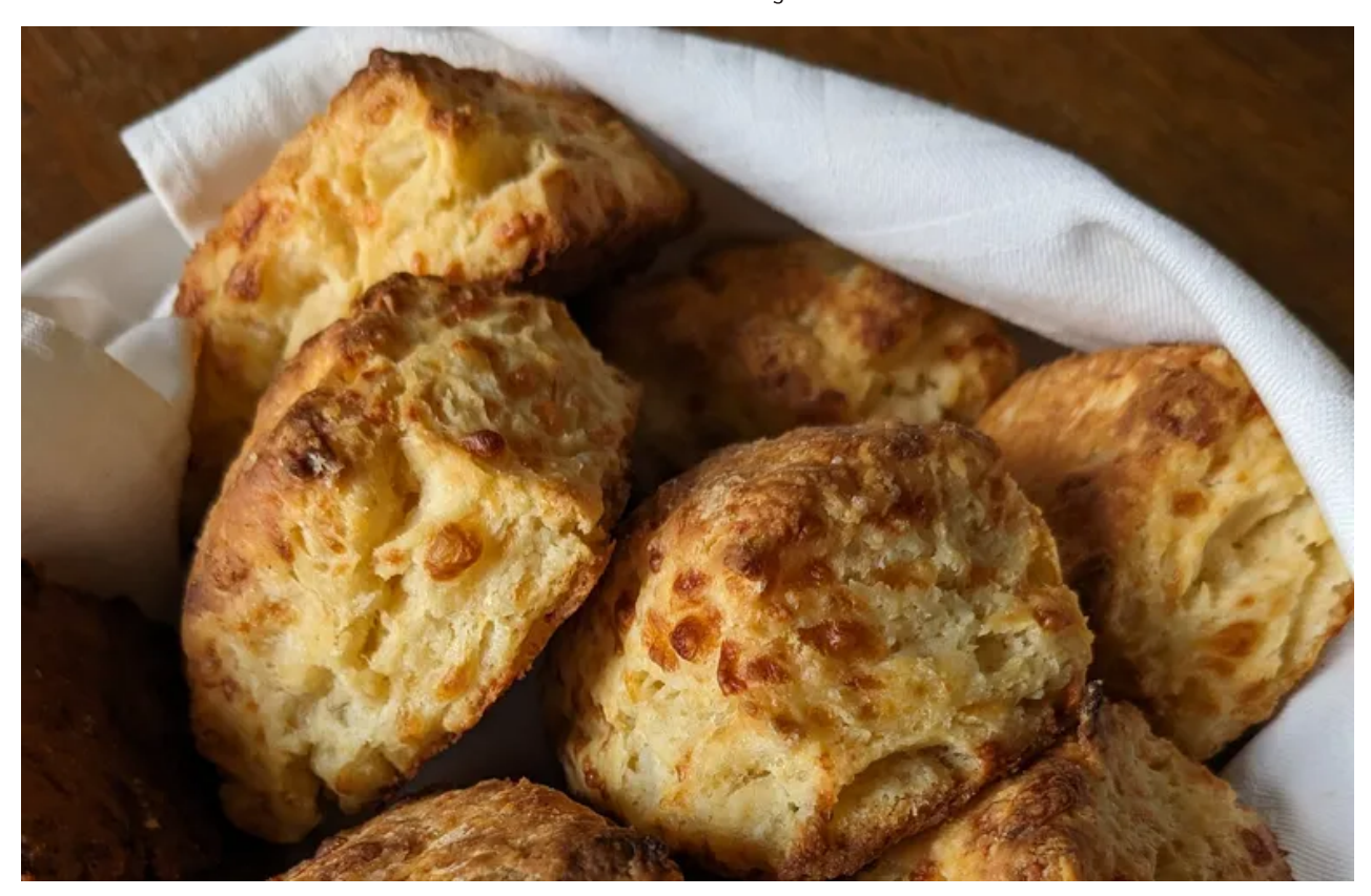
For these Cheese Biscuits, the creamy brick is worth a special trip