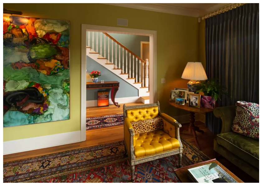
BROADMOOR REMODEL. Greens in the living room play against the Pompeii Blue paint in the entry, with carefully selected white oak flooring throughout. This is a place full of unexpectedly fresh,... (Mike Siegel / The Seattle Times, 2019) More \checkmark

IF YOU'RE GOING to dream bold design dreams, you might as well dream in color. Here are 10 memorably colorful spaces from our NW Living archives to awaken bright inspiration during fall's nightlike days.