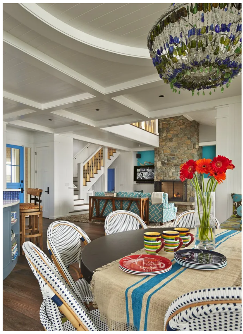
SOUTH SOUND BEACH HOUSE. In this nautical-themed summer getaway, the beachy blues of the kitchen were inspired by a photo of one of the homeowner's moms in a turquoise outfit: a shiny... More V