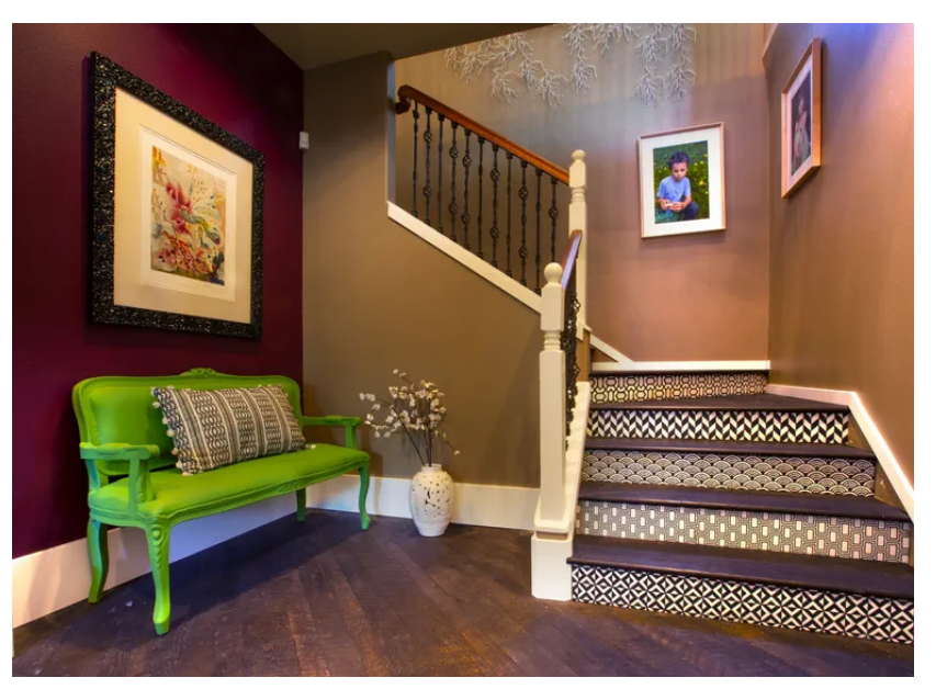
CAPITOL HILL RENOVATION. This enthusiastic entry (green settee under a framed Salvador Dali lithograph; individually stenciled, black-and-white patterned stair risers; a deep, dark chandelier... \mathbf{More} \checkmark