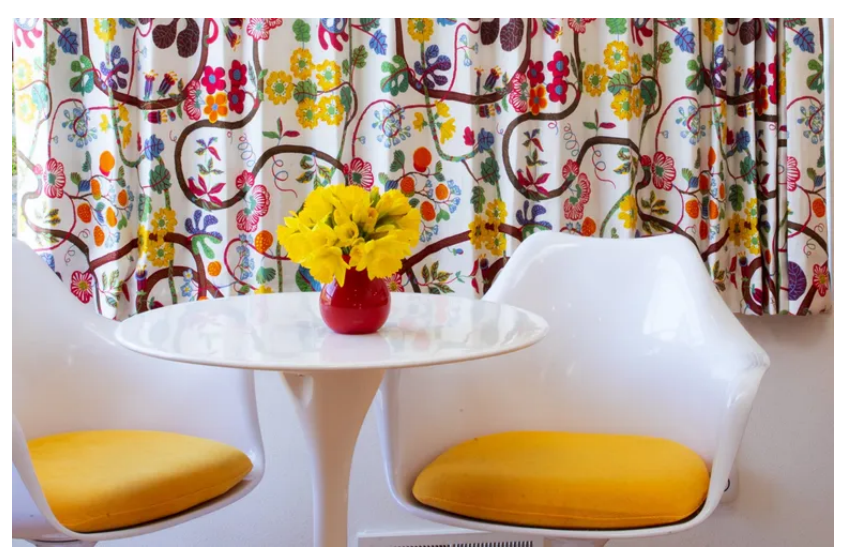
MAGNOLIA REMODEL. Color is key in this remodeled home, and in Scandinavian design: White walls meet neutral warm wood floors, dotted with bold brightness. This cheerful curtain fabric, by Swedish... More V