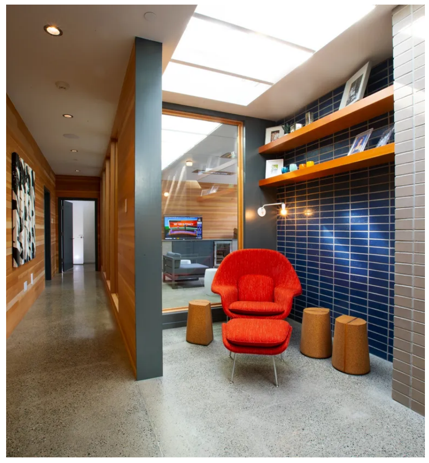
CLYDE HILL NEW HOME. Glazed blue bricks meet muted gray bricks and ground-face concrete flooring in the reading nook, a cozy transition from public spaces to private ones, while showcasing a... More >