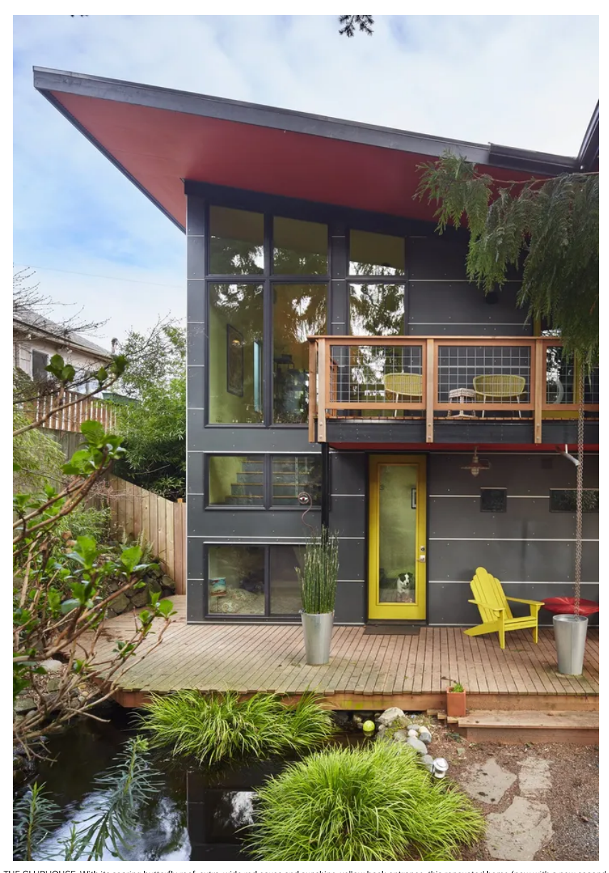
THE CLUBHOUSE. With its soaring butterfly roof, extra-wide red eaves and sunshine-yellow back entrance, this renovated home (now with a new second floor) looks through a colorful lens at a Phinney Ridge backyard filled with greenery galore and a waterfall that obscures street noise. Less \( \)