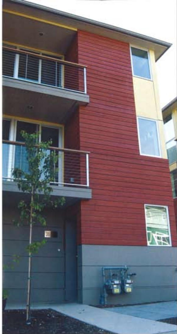
Above: The in-fremont town houses feature an aptly colorful facade. Opposite, top to bottom: Eco elegance is on display in both living room and bedroom, which also boasts one of two balconies.